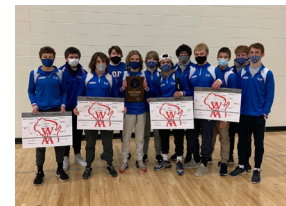
Lodi High School Grades 9-12