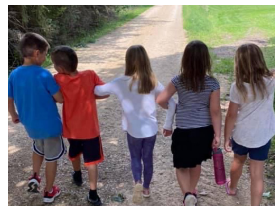
Lodi Elementary/OSC Charter School Grades 3-5