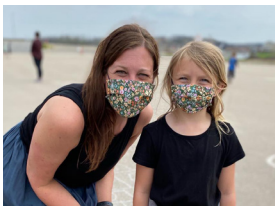
Lodi Primary School EC, 4K-2nd Grade