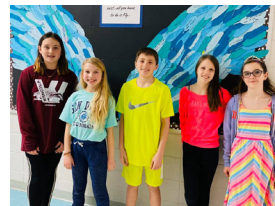
Lodi Middle School Grades 6-8