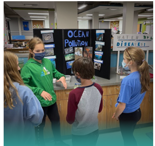
Ouisconsing School of Collaboration is a multi-age, project-based charter school within the District for students grades 3-5.

Lodi has robust exchange programs with schools in Costa Rica, Germany, and Thailand. LHS is the only school in Wisconsin with a class taught by a teacher in another country (Cultural Geography of Southeast Asia class taught by a teacher in Thailand).